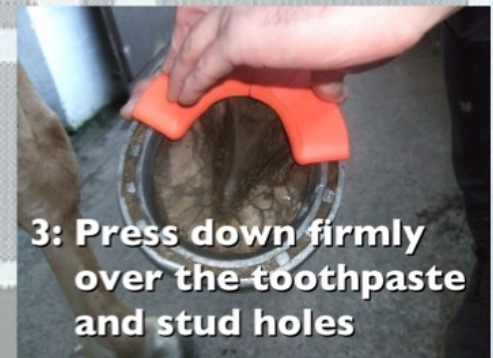
3: Press down firmly over the toothpaste and stud holes