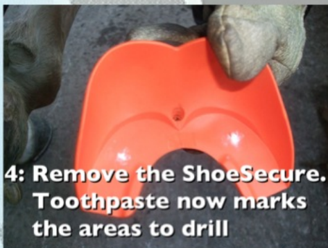
4: Remove the ShoeSecure. Toothpaste now marks the areas to drill