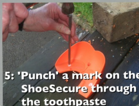
5: 'Punch' a mark on the ShoeSecure through the toothpaste