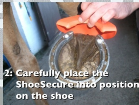
2: Carefully place the ShoeSecure into position on the shoe