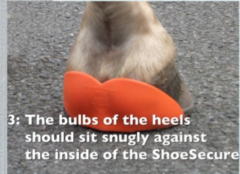
3: The bulbs of the heels should sit snugly against the inside of the ShoeSecure