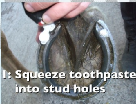
1: Squeeze toothpaste into stud holes