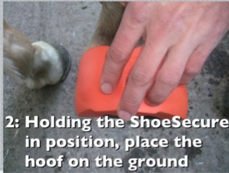
2: Holding the ShoeSecure in position, place the hoof on the ground