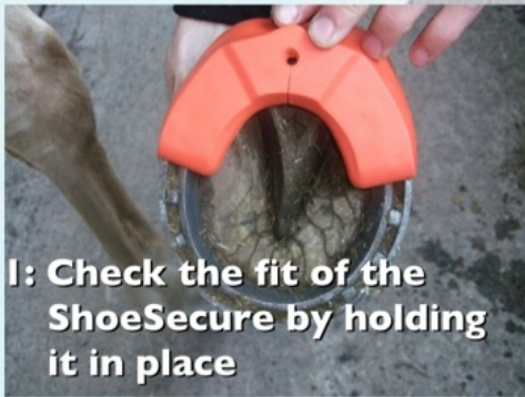
1: Check the fit of the ShoeSecure by holding it in place