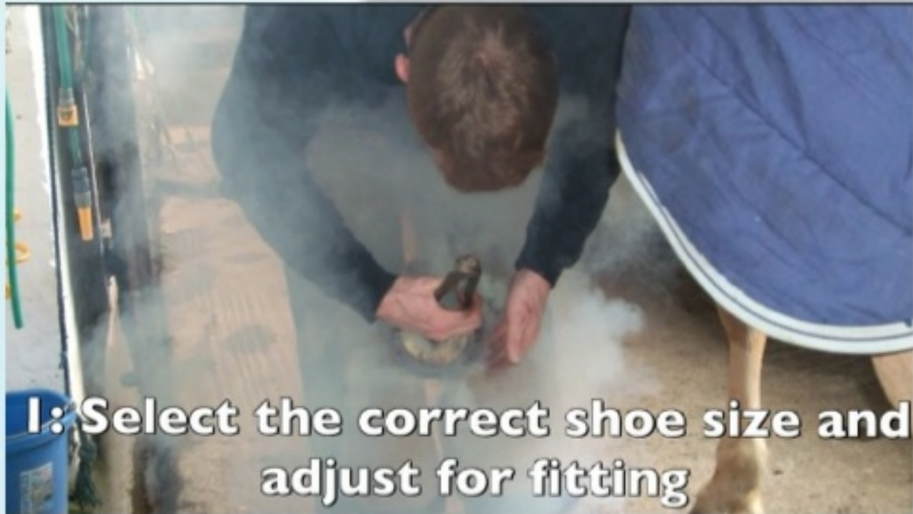
1: Select the correct shoe size and adjust for fitting