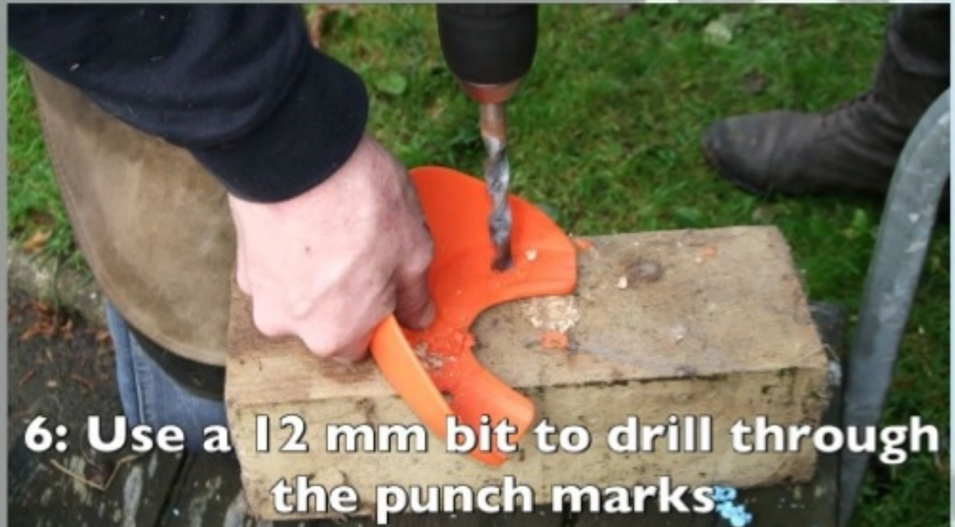
6: Use a 12 mm bit to drill through the punch marks