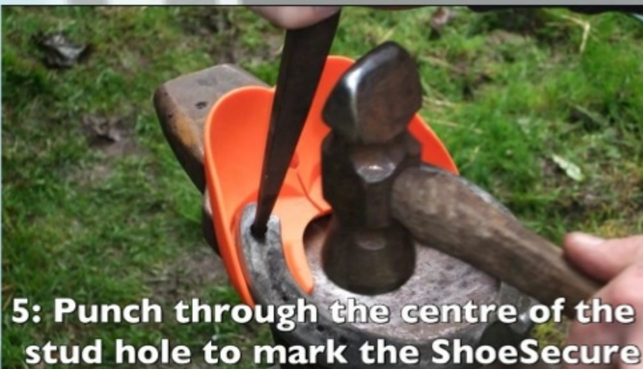
5: Punch through the centre of the stud hole to mark the ShoeSecure