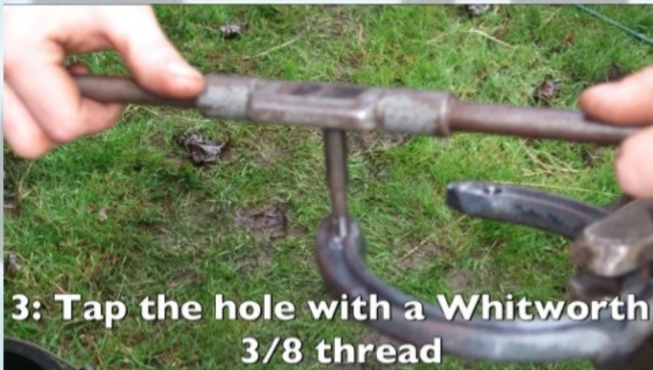
3: Tap the hole with a Whitworth 3/8 thread