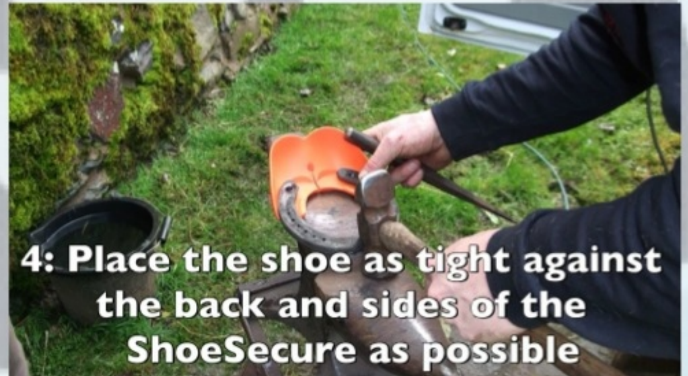
4: Place the shoe as tight against the back and sides of the ShoeSecure as possible