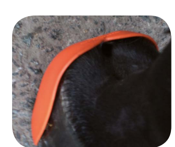
Back view US 8,651,193 B2