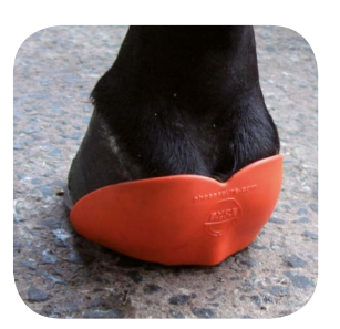
View of heels from above Patent Number GB2463542